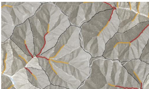
Figure 1. Example of DDFTAs from the FPA Streams and Steep Slopes Viewer.

DDFTAs are divided into two categories: those with a probability of traversal in the upper 20 percent (displayed as red online, Trav_prop 0.8-1.0 in downloadable layer) and those with a probability of traversal between 20 and 50 percent (displayed as gold online, Trav_prop 0.5-0.8 in downloadable layer).