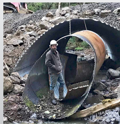
FISH PASSAGE PROJECT

The department has a new Small Forestland Owner (SFO) Office and dedicated SFO foresters to help small forest landowners with their forest management goals. New programs help with fish passage projects on forest roads, tax credits and more. Visit the SFO Office webpage for more information.