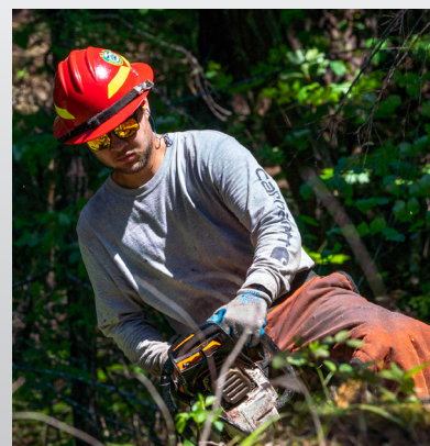
STAY NOTIFIED OF RULE CHANGES