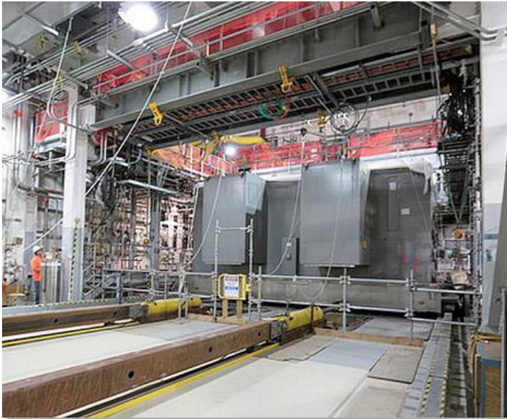
Low-Activity Waste Facility