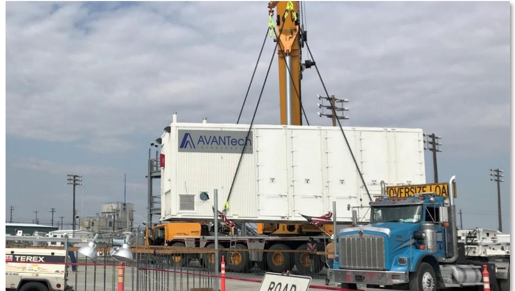
Tank-Side Cesium Removal system