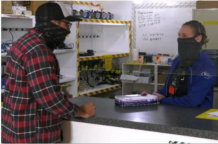
Plexiglas shields at the 324 Building