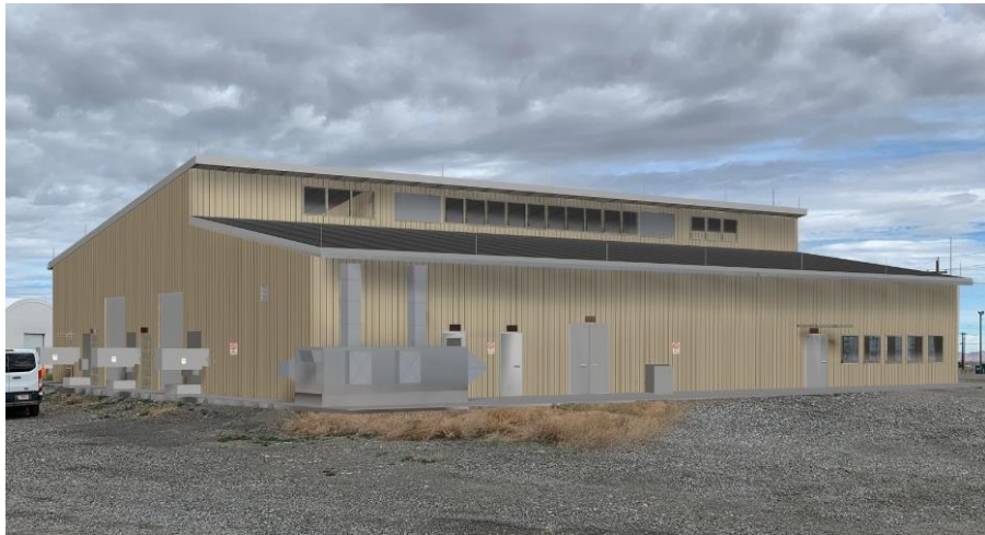
Rendering of the future Water Treatment Plant