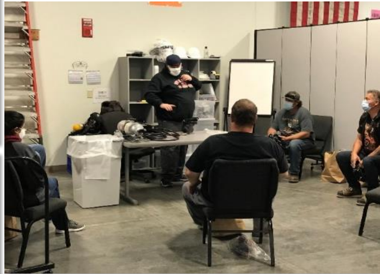
Safety protocols for return to work training