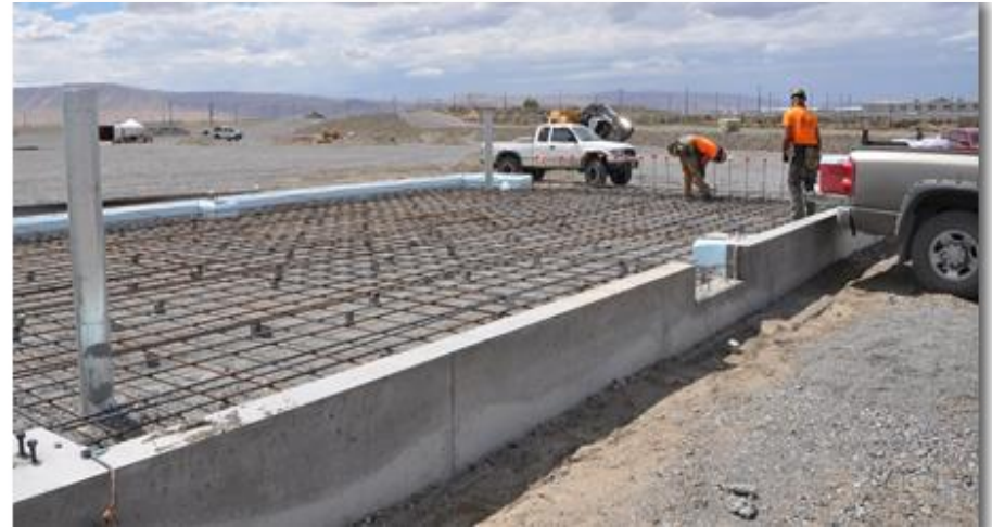
Integrated Disposal Facility