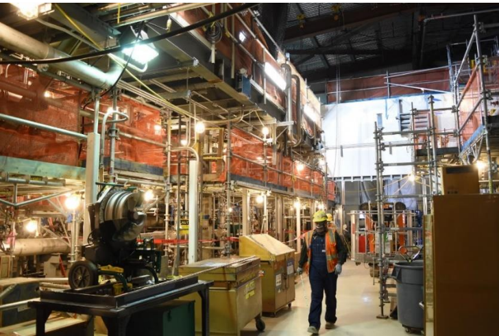
Effluent Management Facility