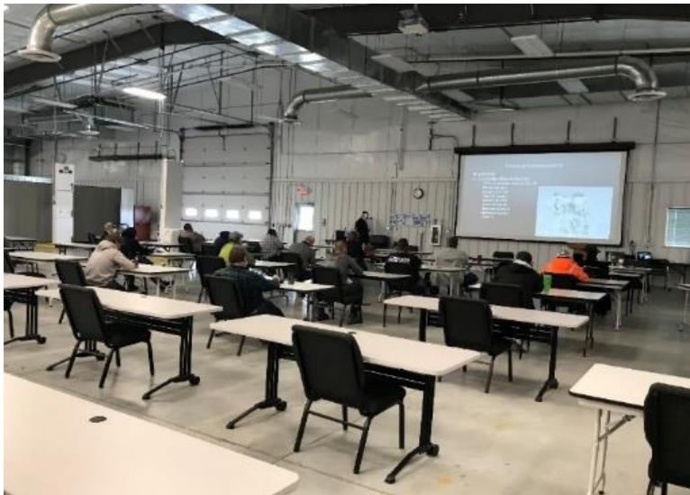
HAMMER training classroom arrangement