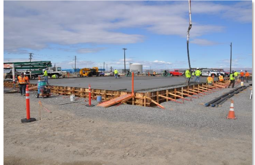
Waste Encapsulation Storage Facility pad construction