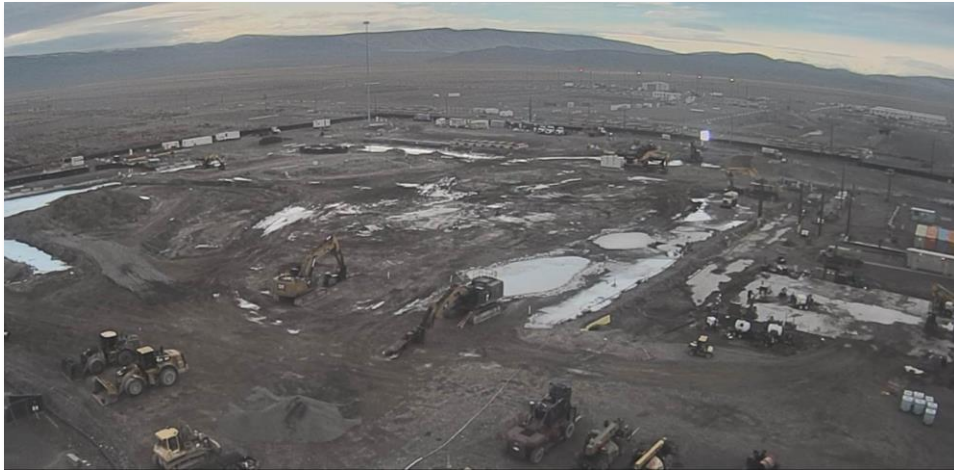
Plutonium Finishing Plant