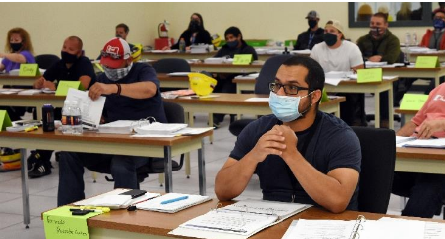
Commissioning technicians in training