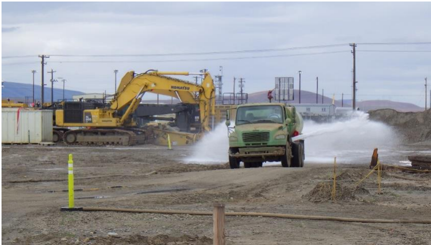
Plutonium Finishing Plant fixative application