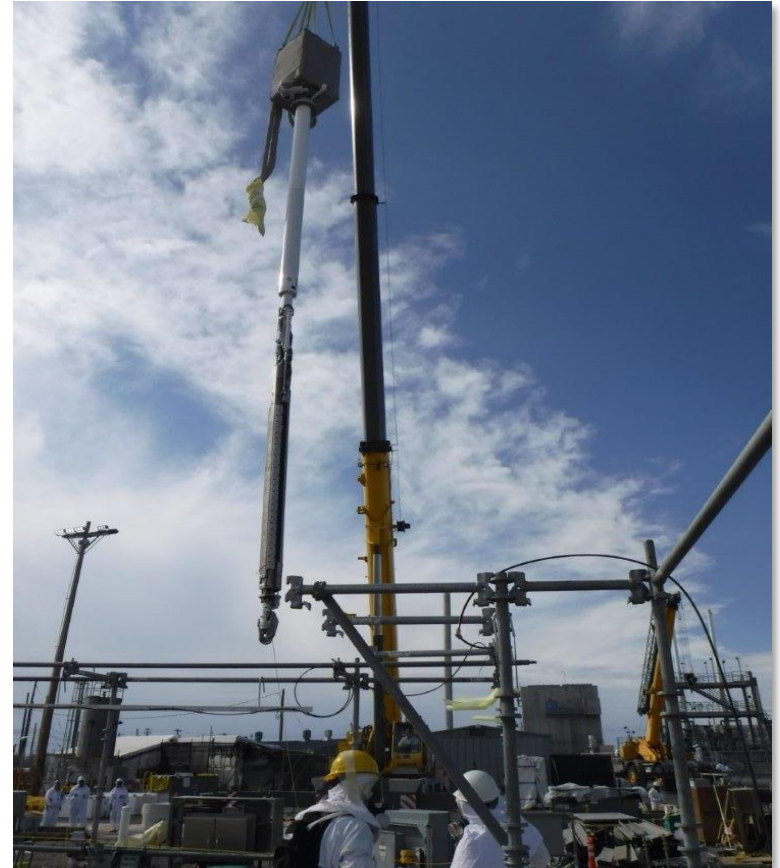
Tank AX-104 retrieval preparations