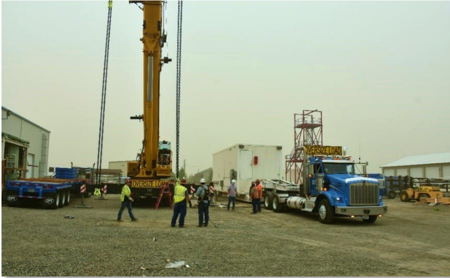
TSCR transportation to site location