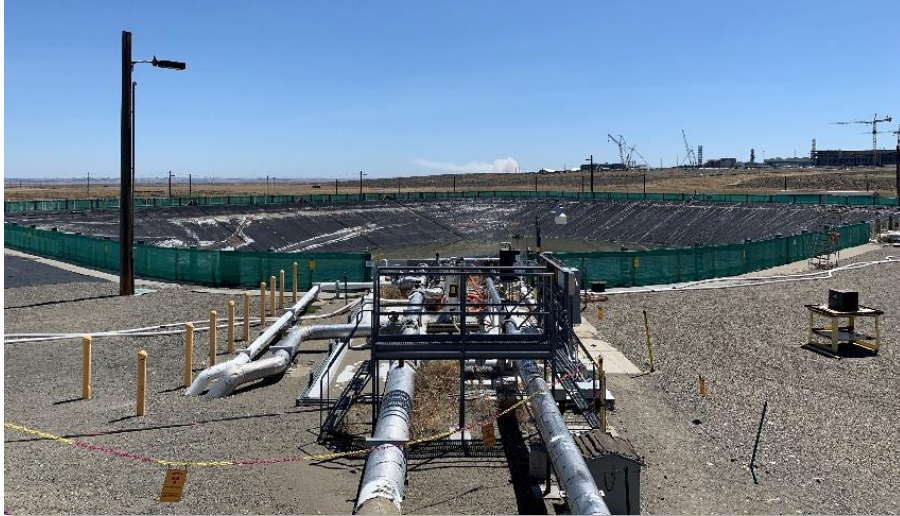
Liquid Effluent Retention Facility