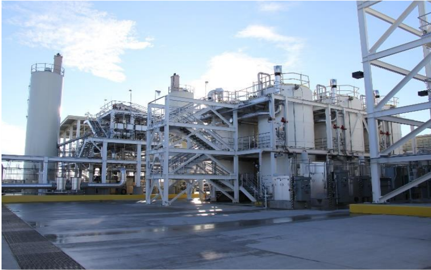
More than 2.4 billion gallons of water treated in fiscal year 2020