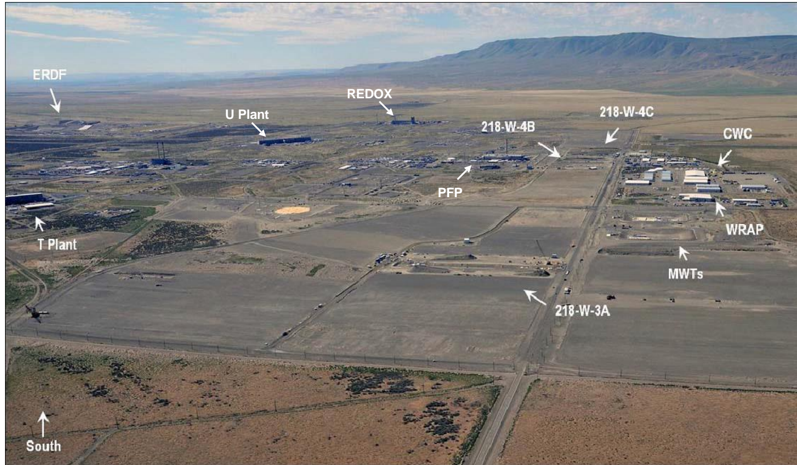
Looking South toward Rattlesnake Mountain